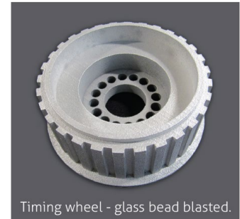
Timing wheel - glass bead blasted.