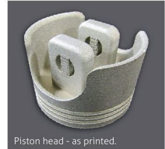
Piston head - as printed.

Elementum 3D's 2024 Aluminum Metal-Matrix Composite (MMC) with two percent ceramic provides excellent strength, good ductility along with the wear resistance of ceramic reinforcing phases. A2024-RAM2 is suitable for many applications and is an outstanding additive material solution for structural components. It is heat treatable like wrought 2024 aluminum.